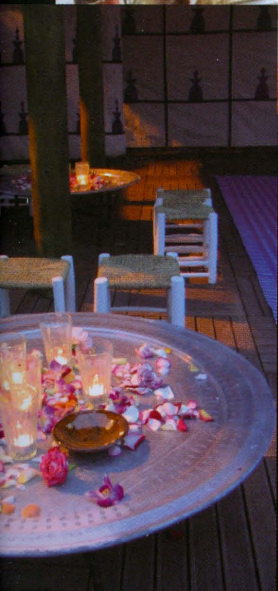
Mondo Mediterraneo, banqueting